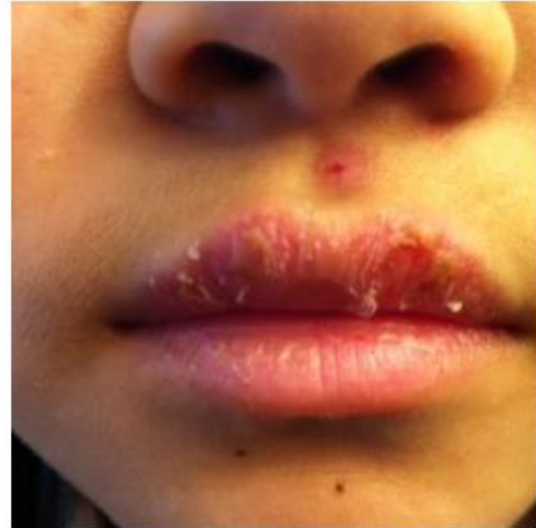
5 hrs after 30 minutes treatment 4/7/2013