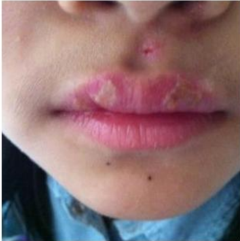
flares up after 3 days occurred 4/7/2013

Herpes Simplex healed without any medicines or supplements.