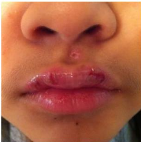
24 hrs after treatment 4/8/2013